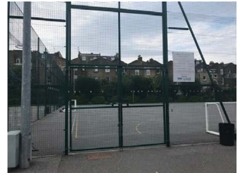
On entrance to the MUGA (Yr7 and 8)