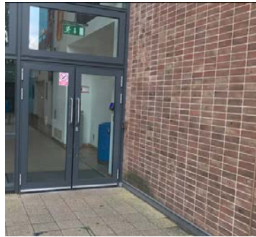
On entrance from the playground on blue side