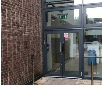
On entrance from the playground on yellow side