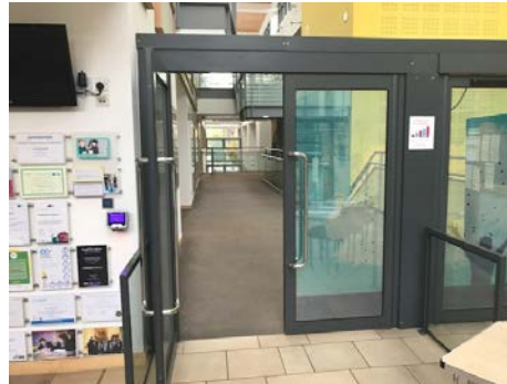
On entrance through the double doors into school